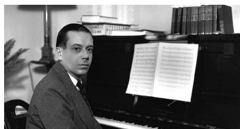
Cole Porter at a piano

Cole Porter, born in Peru, Indiana in 1891, wrote some of the cleverest, funniest, and most romantic songs ever written. He studied music from an early age and began composing as a teenager. At Yale University, he was voted “most entertaining man”. After a brief stint at Harvard Law School, he returned to music full time, writing a number of hit Broadway musicals, including “Kiss Me Kate”, “Can Can”, and “Anything Goes”. His hundreds of songs have been recorded by countless artists, including Ella Fitzgerald, Louis Armstrong, and Lena Horne. His life was documented (unrealistically) by the movie “Night and Day” in 1945, and somewhat more realistically in the film “It’s De-Lovely” in 2004. Tonight’s medley includes “Begin the Beguine”, “Love for Sale”, and “Anything Goes”.