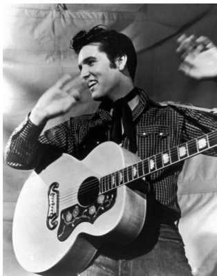
The King! - Elvis Presley